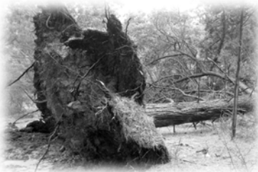
Uprooted Tree in Kalang Park

In early December last year a fierce storm with very strong winds whipped through central Blackburn. Many branches were torn off trees and bushes, and a number of precious mature eucalypts either broke, or were torn out by the roots. The damage was severe. Major damage also occurred to a number of houses in the vicinity. On the positive side, broken branches do promote the development of nesting hollows, and are part of the natural cycle, but the loss of whole trees is quite a blow. It is the usual practice in bushland reserves to leave fallen timber to contribute to habitat.