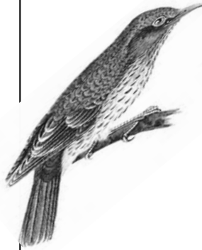
Olive-backed Oriole Illustration Neville Cayley ANBG

A pair of Royal Spoonbills 5 Hardhead Ducks A family of Pink-eared Ducks, A Fan-tailed Cuckoo An Olive-backed Oriole A pair of Sacred Kingfishers A family of King Parrots Flocks of noisy Gang-gang Cockatoos