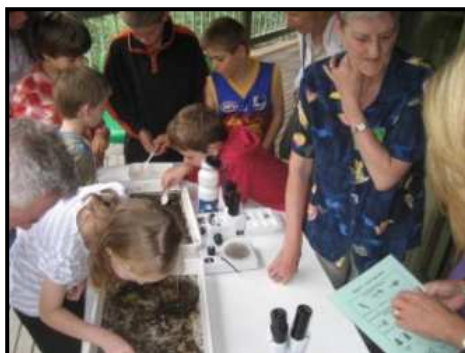
Volunteers at work in the Visitor Centre

Late last year Furness Park was home to this spectacular beehive constructed on the outside of a dead tree.