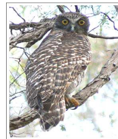
Photograph – Duncan

We are very fortunate to have a pair of Powerful Owls living in our Blackburn Lake, Creeklands, and Wandinong Sanctuary areas. While it is true that Powerful Owls have been around in these areas for a long time, it is only in the last 2 to 3 years that we have a pair of owls trying to breed. During May, June and July they are very vocal, mate and lay eggs.