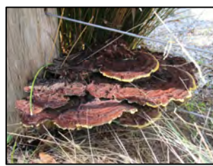
Cage fungi ( Ileodictyon cibarium ) Coral fungi ( Clavaria amoena ) Bracket fungi