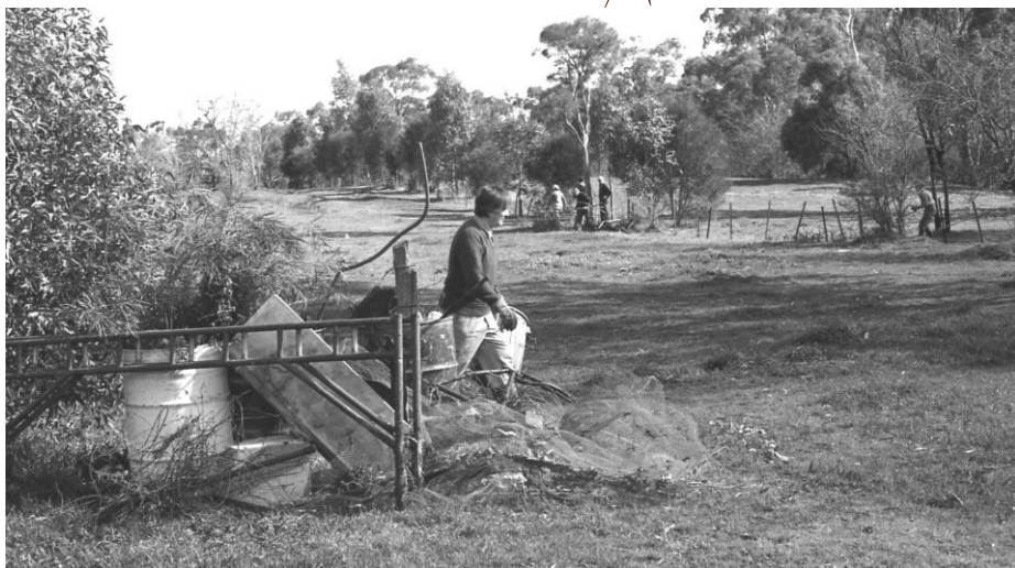
Working bee on 16 August 1981 to clear rubbish left by years of horse agistment. Note fences criss-crossing area.

Who Should You Call If You See A Problem in our Bushland parks?