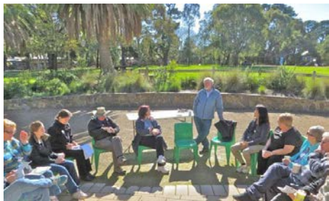
Tallying species over a cuppa after the 2013 Spring bird survey.