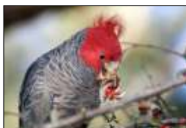
Male Gang Gang Cockatoo