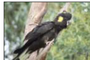
Yellow-tailed Black Cockatoo

Two regular visitors to Whitehorse